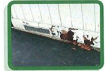
Aging buildings in Rocklin schools need repairs.